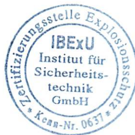
- Seal - (ID no. 0637)